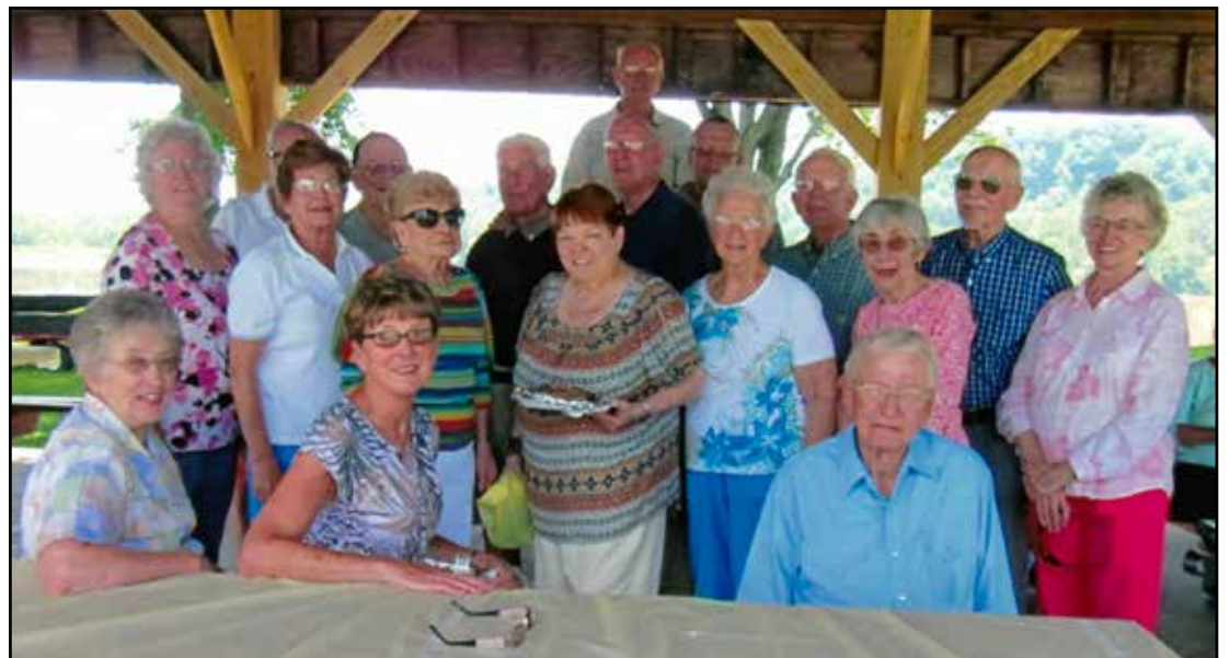
The Ravenswood group enjoyed a June picnic. Four of the retirees are over 90.

A difficult but very important service we perform is helping spouses deal with the loss of his or her partner. We try to help them through the grieving process and file all the necessary paper work.