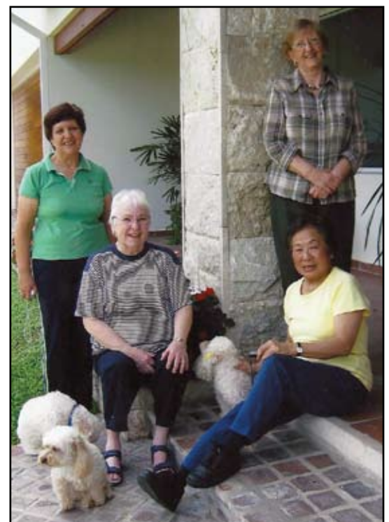
(What's Going On, continued Page 3)