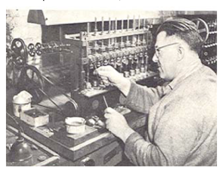
to its product range. VP and GM D.A. 'Dusty' Rhoades called the move "a natural extension of the corporation's

February – Kaiser Aluminum acquires the Bristol, RI wire and cable plant from U.S. Rubber, to add insulated conductor