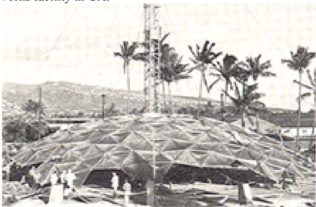
Part way through, the dome begins to assume its characteristic shape. Panel installation was completed in just 20 hours.

March – A 49-foot high aluminum dome auditorium is completed in less than a week at the Hawaiian Village resort located in Waikiki, Honolulu, HI. The 575-panel dome, made from 6061-T6 alloy aluminum sheets about 1/16<sup>th</sup> inch thick, was constructed from the top down, using a central hoisting mast. Designed and built by Kaiser Aluminum engineers, the structure was test-fabricated at the corporation's Permanente Works facility in CA.