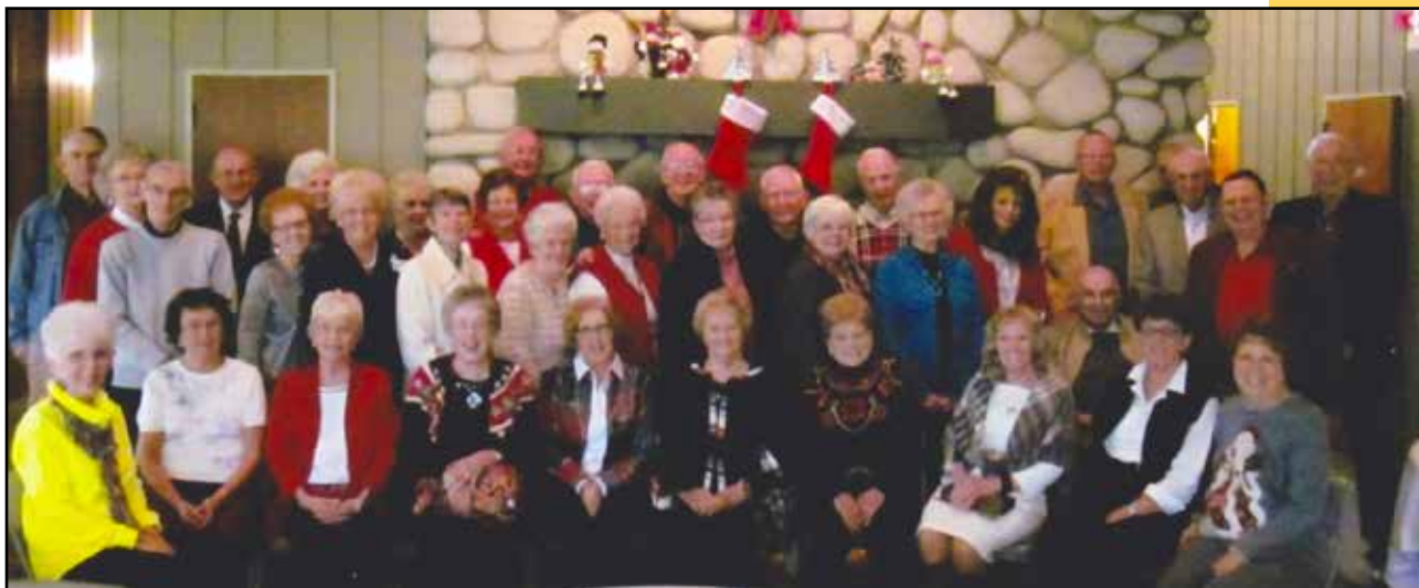
Ravenswood, WV, retirees gathered for a Christmas luncheon at the Greenhills Country Club on Friday, Dec. 2.