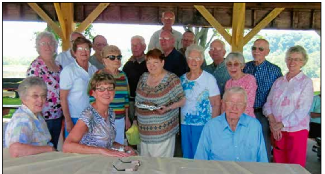
The Ravenswood group enjoyed a June picnic. Four of the retirees are over 90.

A difficult but very important service we perform is helping spouses deal with the loss of his or her partner. We try to help them through the grieving process and file all the necessary paper work.