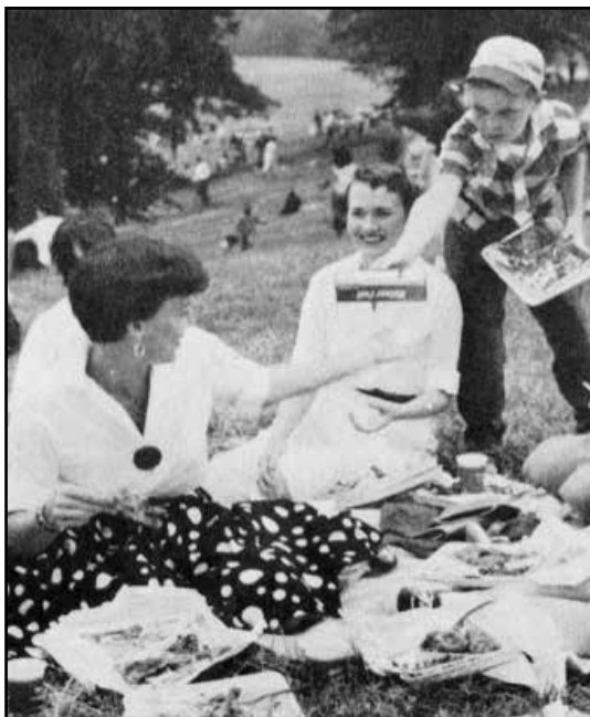
A look into the past. Here families enjoy the second annual open house at Kaiser Aluminum Ravenswood Works in 1958.