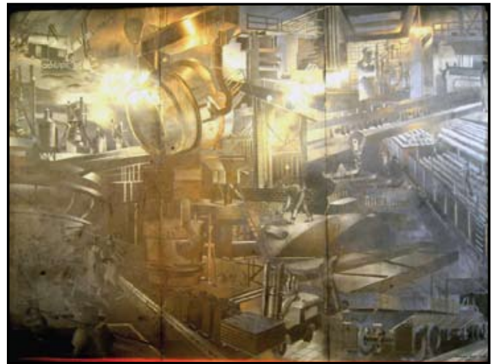
Bel Jon Mural